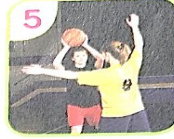
5 play basketball