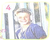
4 listen to music