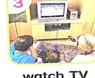
3 watch TV