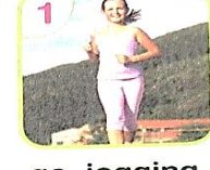
1 go jogging