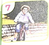
7 ride a bike