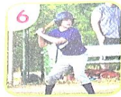
6 play baseball