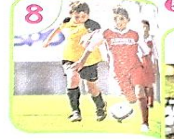
8 play football