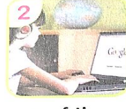
2 surf the Internet